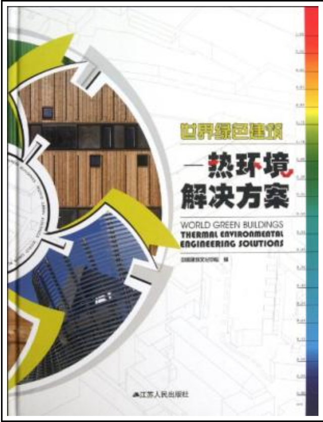
Filesize: 2.93 MB