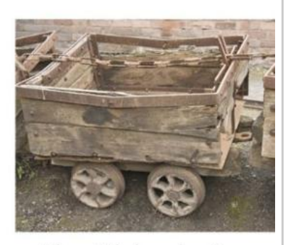
Zinc Mining in Tennessee